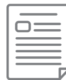
STATEMENT OF CHANGES IN NET ASSETS