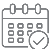
SCHEDULE OF INVESTMENTS