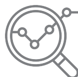
CAPITAL ACCOUNT ANALYSIS